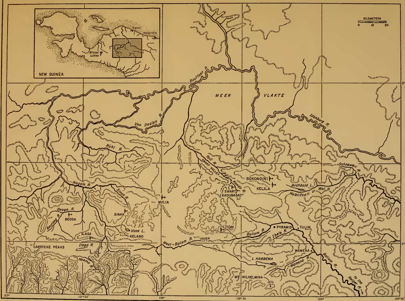
Figure 1. Map of the central highlands area mentioned in the text showing the Iloga and west Baliem valleys, the Bokindini and swart valleys and the missionary airstrips. The airstrips are omitted in the Baliem Valley. Note: An alternate spelling of Bokindini is Bokondini.